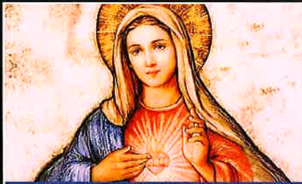
AUGUST Month of the Immaculate Heart

The Church dedicates the month of August to the Immaculate Heart of Mary. It is a dogma of the Catholic faith that Mary is the Immaculate Conception; that is, in preparation for the Incarnation of the Second Person of the Holy Trinity in her womb, she was conceived without the corruption of sin through the foreseen and infinite merits of her Son, Jesus Christ. Over the